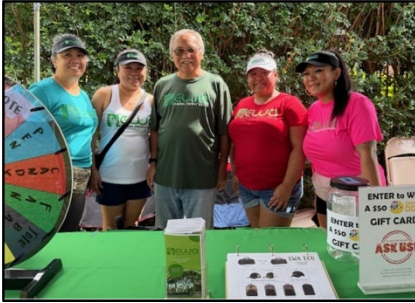
4/12/2025: 'Ewa Historical Society/Hale Kipa La 'Ohana Day

'Ewa FCU was honored to participate/volunteer at the following events occurring in our neighborhood: