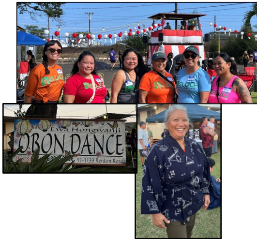
6/21/2025: 'Ewa Hongwanji Mission Bon Dance